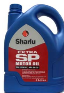
(Left Side View)