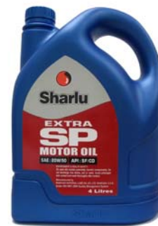
(Left Side View)